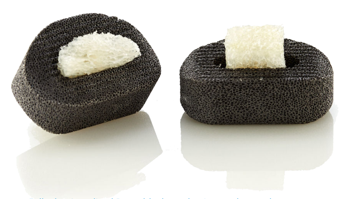
Fully demineralized Puros blocks and strips can be used with Trabecular Metal™ Material (TM-400 Device)

Puros DBM Block and Strip are available in a variety of configurations to minimize the need for shaping during the surgical procedure. They are conveniently provided sterile with up to a five-year shelf life at room temperature.