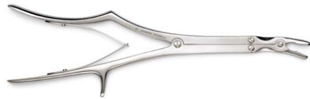
Sybert Rongeur, 8 x 16mm 360mm 07.01221.001